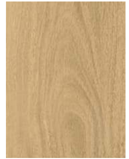
525 Alpine Gum