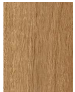
556 Spotted Gum