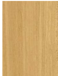
545 New Eng Blackbutt