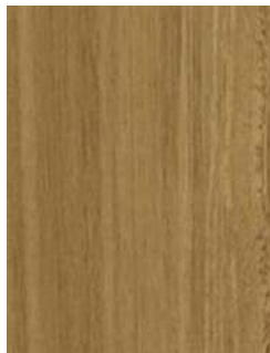
570 Western Blackbutt