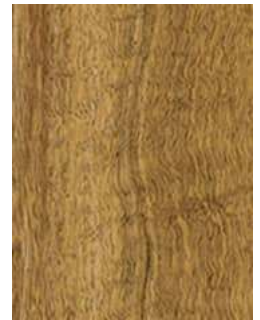
555 Grafton Spot.Gum