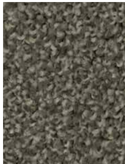
750 Pewter Stipple