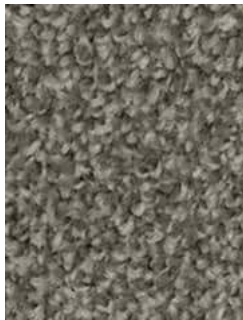
745 Cloud Stipple