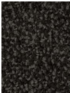
785 Stipple Ebony