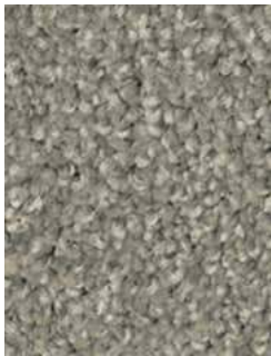
740 Mist Stipple