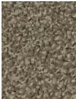
585 Stipple Tumbleweed