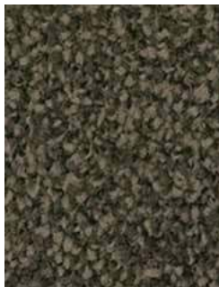
770 Shale Stipple