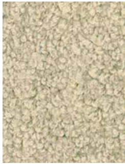
510 Beach Shell