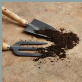
Resistant to everyday dirt and soil

We highly recommend using the PUREFLOR cleaning system to maintain your floor.