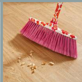
Everyday dirt and crumbs can be simply swept away