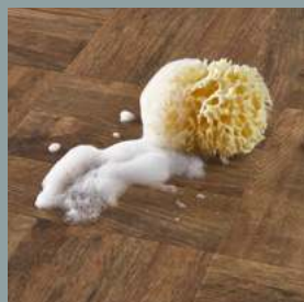
Resistant to accidental splashes and temporary surface water